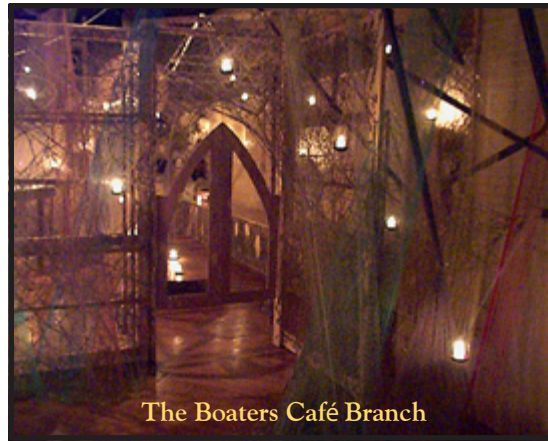
The Boaters Café Branch

Why not drop by one of our branch offices and talk to a member of our varied staff